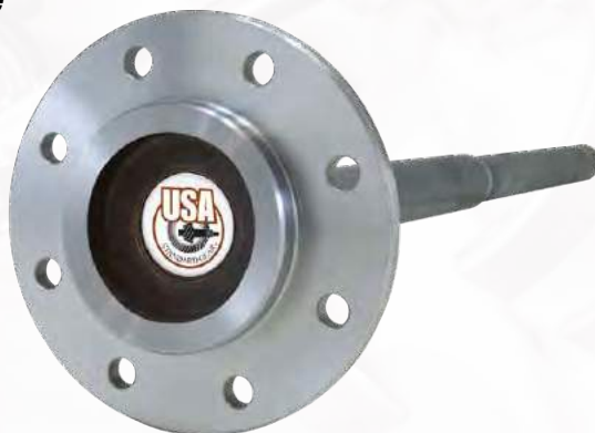
Rear GM Axle