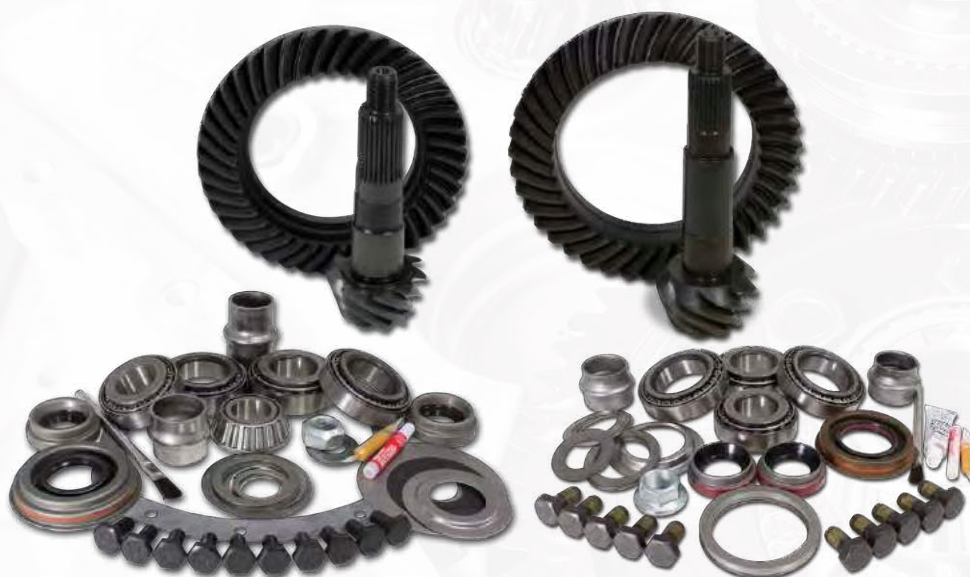
Gear Kit Package