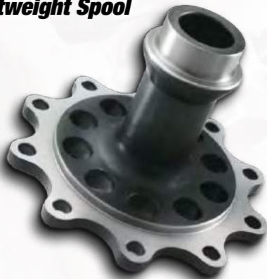
Ford 9" Lightweight Spool