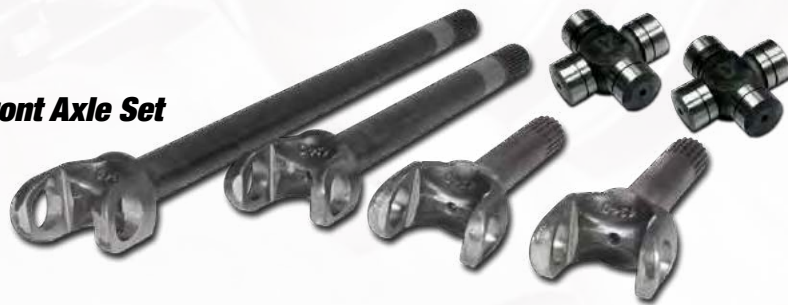
Front Axle Set